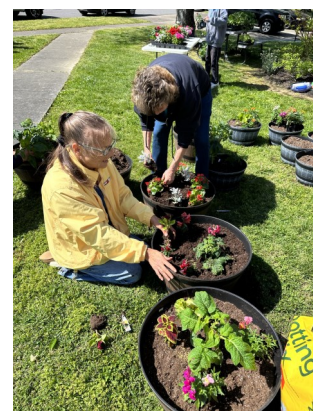
Bruschetta Gardens: Dwarf tomato, pepper, basil and annual flower planting class at Lyon County Housing Authority.